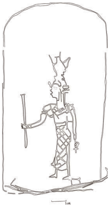
Isis within a shrine on a sacred barque, from the “tank” on the roof of the Mammisi. Drawing by the author.